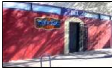
246 N. 4th Avenue

A Foam and Fabric Place is probably Tucson's best kept secret. They have been serving Tucson since the early 1960's. You can find most if not all of your upholstery needs in stock and cut to size. They carry thousands of odds and end items from canvas to burlaps, foams to cotton batting, shade cloths to table covers, webbings to buckles and a lot more.