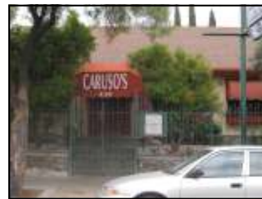
434 N. 4th Avenue

For over 70 years Caruso's has been the cornerstone for Italian cuisine. The menu is everything you would expect from an Italian restaurant. Dinner begins at 4:00pm with seating both inside and out. Enjoy complimentary garlic bread and fabulous dessert. You will find the pricing to be pleasing as well.