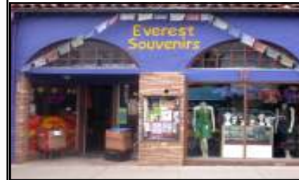
549 N. 4th Avenue

It is all fair trade. Everest Souvenirs sells jewelry, woolen garments, cotton garments, singing bowls, Gurkha knives, shoulder bags, Himalayan herbal incense Nepal is a poor Himalayan country and many villagers make their living by selling their products to the traders like us.