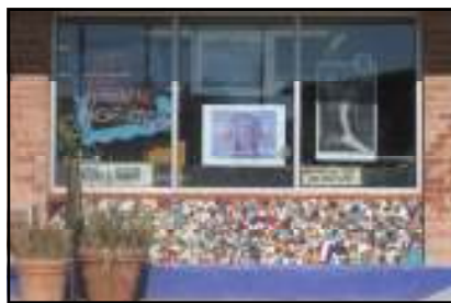
319 E. 8th Street

Serving Tucson since 1992, Barb's Frame of Mind is a full service, custom picture framing and poster shop. They have hundreds of frame samples to choose from; ranging from simple metals to ornate gold leaf. Their staff has extensive framing experience and will enjoy helping you design the perfect presentation for your favorite things.