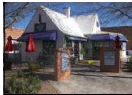
500 N. 4th Avenue

Chocolate Iguana is a on-of-a-kind espresso bar, sweet shop, and café featuring award winning espresso drinks, gourmet sandwiches, made from scratch scones and pastries, decadent desserts, fine chocolates, nostalgic candy as well as unique cards and gifts. The Conklin family hopes you will visit them at Chocolate Iguana to enjoy their charming indoor atmosphere and tree shaded patio seating 7 days a week.