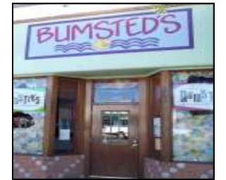
500 N. 4th Avenue

At Bumsted's you can lose yourself in the 750 gallon saltwater aquarium while enjoying a refreshing cocktail. Surf the internet with free WiFi and enjoy their fabulous food. Bumsted's is known for their large portions and better ingredients.