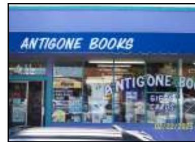
411 N. 4th Avenue

Antigone Books is a zany bookstore with a feminist slant. Stop by and browse their large selection of books, laugh at their bumper stickers, find that perfect gift, pick the card that says just the right thing or enjoy their store events.