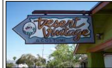
636 N. 4th Avenue

Desert Vintage is a small store with a large selection of post-hippie clothing for both adults and children, as well as a selection of textiles and linens. They carry a wide range of items from Nehru jackets to Victorian dresses. There are also hats, ties and other accessories.