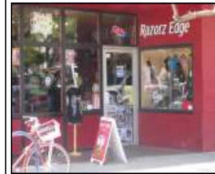
427 N. 4th Avenue

Razorz Edge carries men's and women's clothing and accessories catering to the rocker in all of us. They also carry clothing, accessories and art from local artists. Check out Razorz Edge for their sales and promotions. Gift certificates are available.