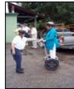
531 N. 4th Avenue

Their tours are designed to allow you to experience a Segway PT while enjoying some of the most interesting places Tucson has to offer. You will receive basic operation, etiquette, and safety training (20-30 minutes), included in each tour. To schedule a tour, please call (800) 979-3370 or (212) 209-3370.