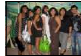
ZT Boutique 414 E. 7th Street

ZT Boutique specializes in Women's accessories and apparel. They are open M- W. ZT offers personal shopping by appointment for those who cannot make it on those days. Private group parties are always welcome. The boutique offers unique items at great prices and caters to all ages and sizes.