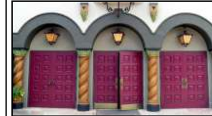
Rogue Theatre 300 E. University Blvd

The Rogue Theatre had their Grand Opening Celebration on September 11. They are located at The Historic Y. Their goal is to present plays which offer complex and provocative points of view related to important social, political, and personal issues.