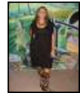
Caravan Serai 408 E. 7th St.

Caravan Serai has eco-friendly & fair trade gifts. They have everything from gold painted Moroccan tea glasses to batik wall hangings from India. They also carry beautiful handcrafted jewelry from all over the world. The sale of each piece helps the artisans who created them.