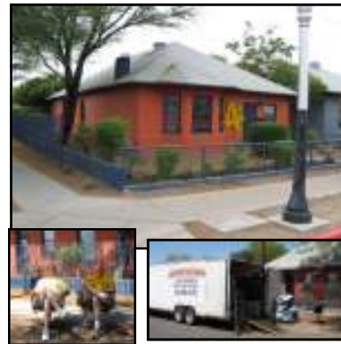
New FAMA office at 434 E. 9th Street

If you have not had the opportunity to visit our new office, please stop by for a cup of coffee and a personal tour.